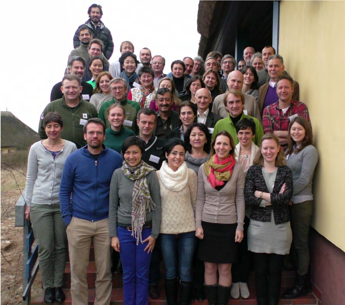
Picture: Group picture with workshop participants.

built up strong and long-term partnerships with local and national organizations and experts. The workshop - as becomes obvious from the documentation below - reiterates that building on these partnerships as well as further strengthening joint approaches and cooperation is one of the key elements for success.